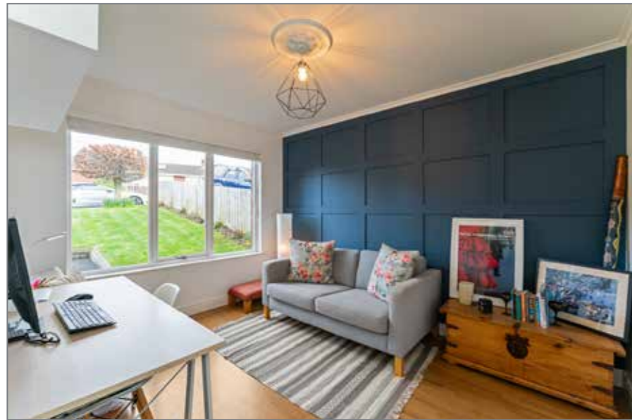
LOUNGE: 12' 0" x 9' 3" (3.66m x 2.83m) Wall panelling.