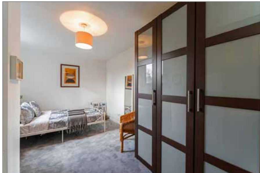
BEDROOM (3): 14' 12" x 8' 9" (4.57m x 2.66m)