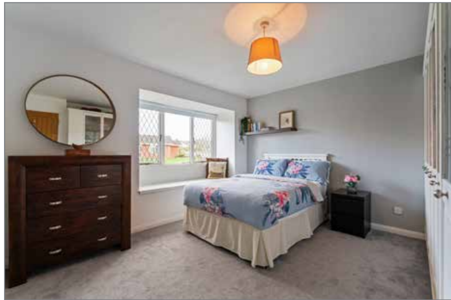
BEDROOM (2): 12' 5" x 10' 8" (3.78m x 3.26m)