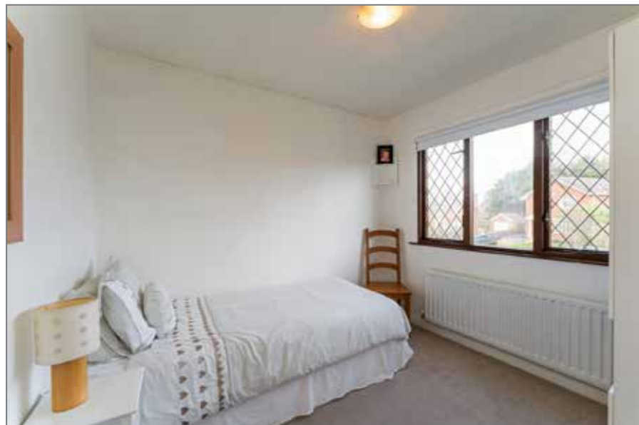
BEDROOM (4): 9' 5" x 8' 2" (2.86m x 2.5m)