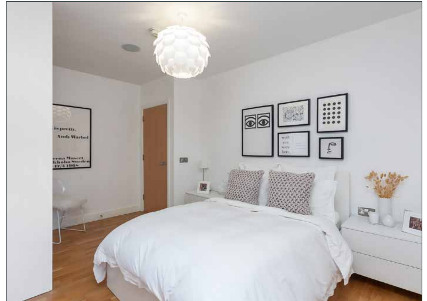
BEDROOM (1): 11' 1" x 10' 5" (3.38m x 3.18m) Built in mirrored sliderobe. Laminate wood floor.