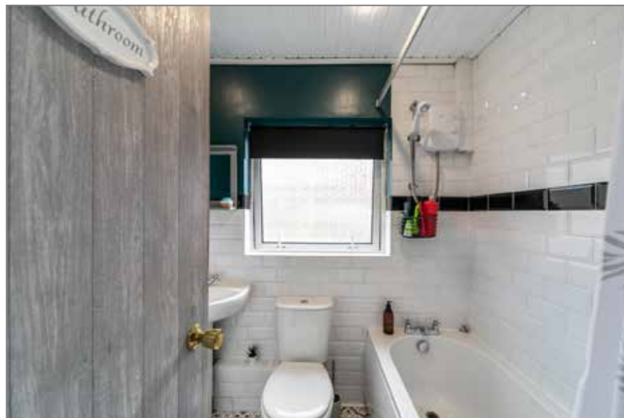
BATHROOM: White suite comprising: Panelled bath with mixer taps and Triton electric shower, low flush WC, pedestal wash hand basin with mixer taps.