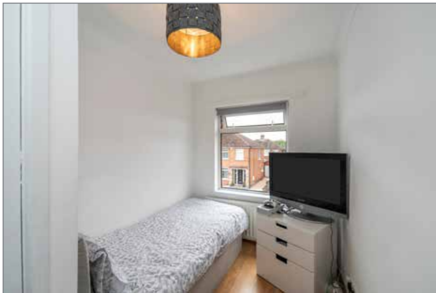
BEDROOM (3): 6' 11" x 6' 7" (2.11m x 2.01m) Wood laminate floor, built in wardrobe.