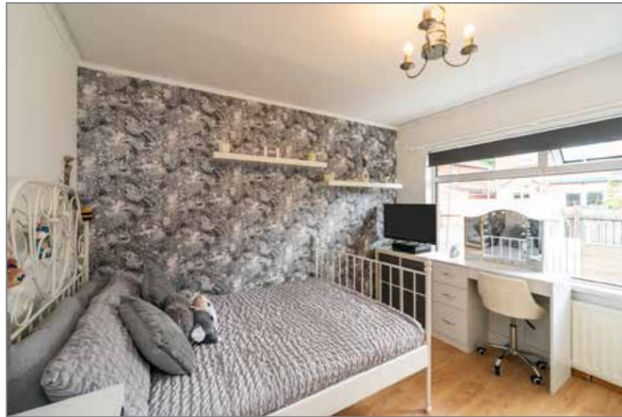
BEDROOM (2): 10' 10" x 10' 2" (3.3m x 3.1m) Wood laminate floor.