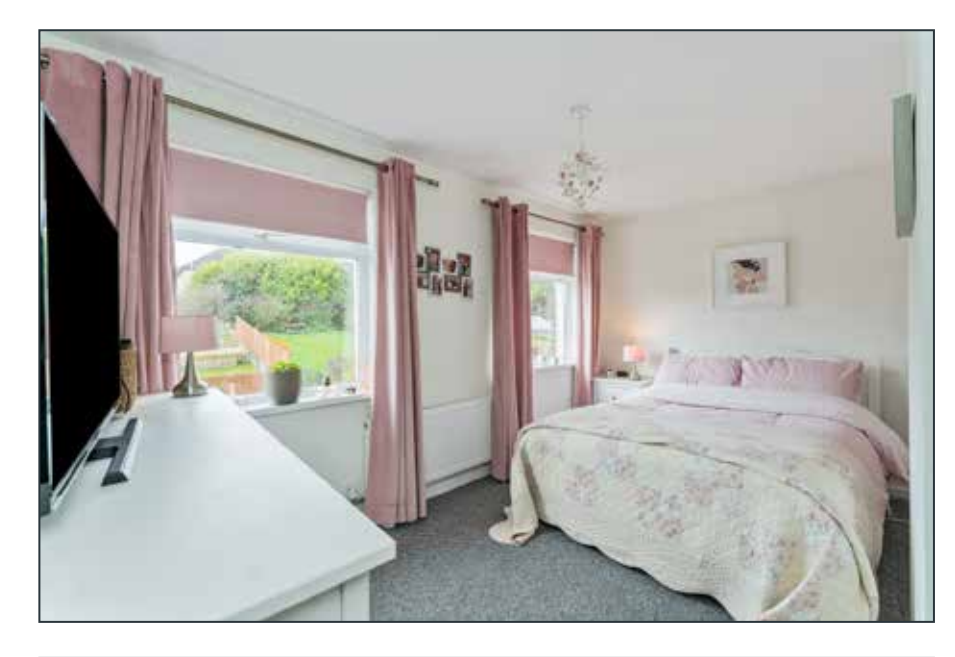
BEDROOM (1): 13' 4" x 8' 9" (4.06m x 2.67m)