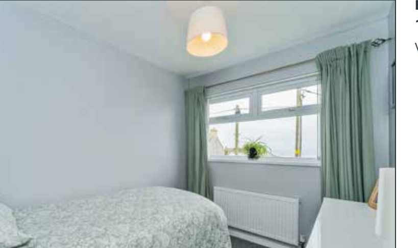
BEDROOM (2): 12' 2" x 7' 9" (3.71m x 2.36m) Views to Irish Sea.