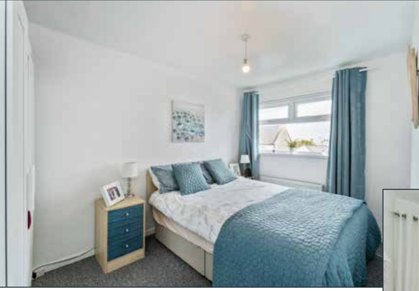
BEDROOM (3): 9' 2" x 6' 11" (2.79m x 2.11m) Views to Irish Sea.

BEDROOM (4): 9' 3" x 7' 2" (2.82m x 2.18m) Views to Irish Sea.