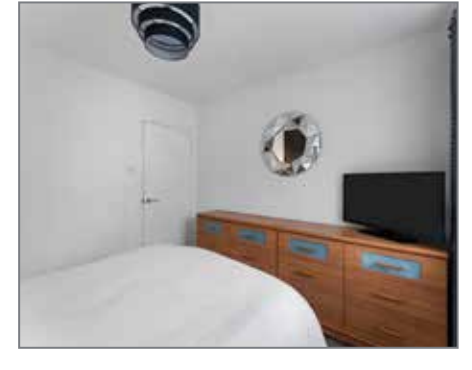
BEDROOM (2): 12' 1" x 6' 2" (3.68m x 1.88m)