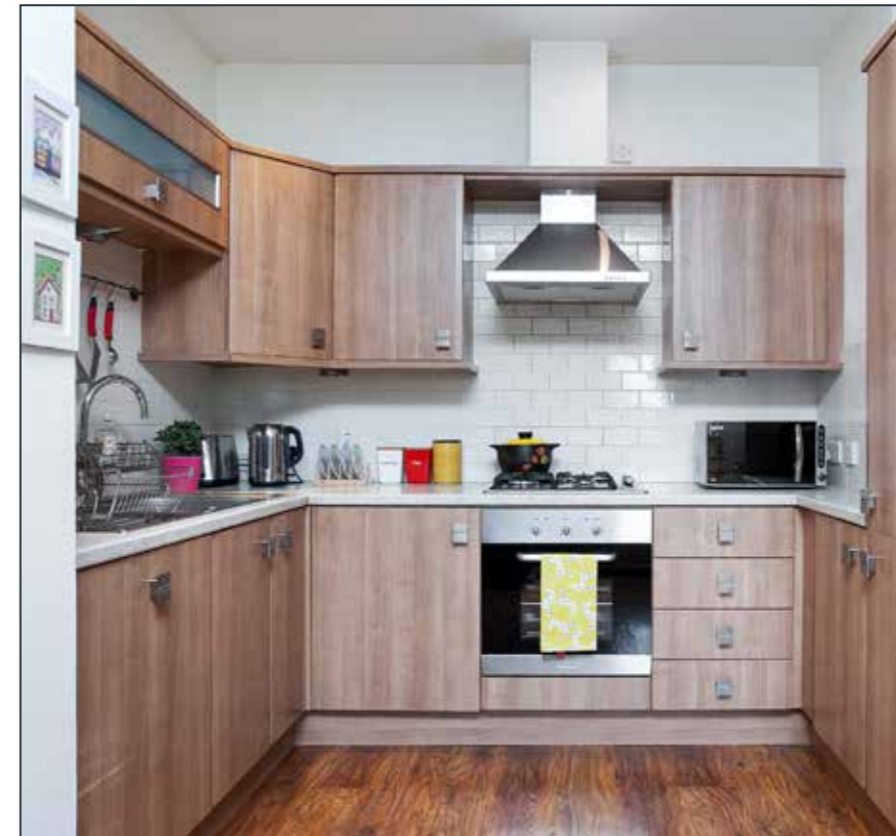
KITCHEN: 9' 6" x 6' 5" (2.9m x 1.96m) Range of high and low level units. Inset sink. Oven and hob. Integrated fridge freezer.