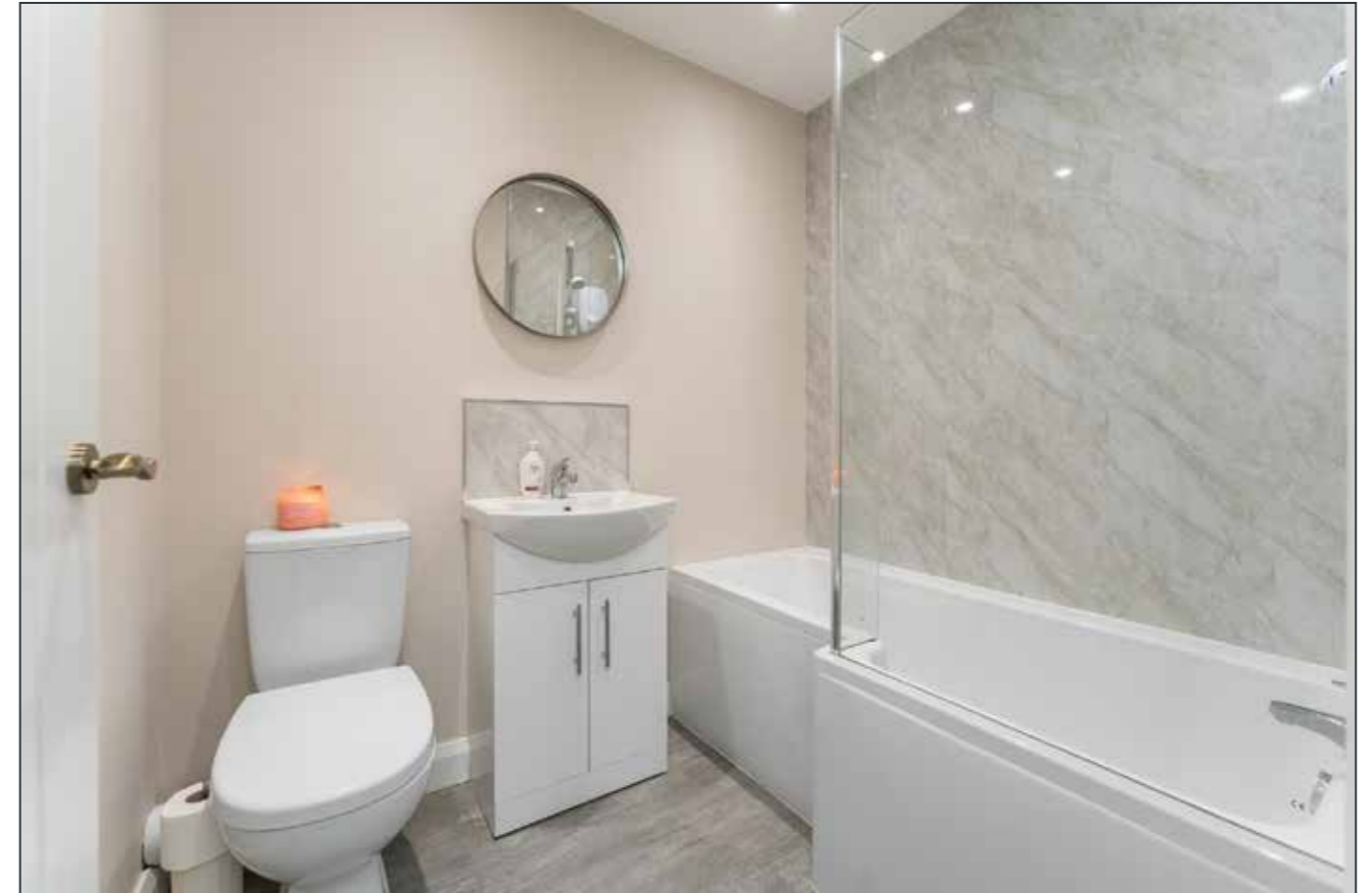
HALLWAY: Linen cupboard.