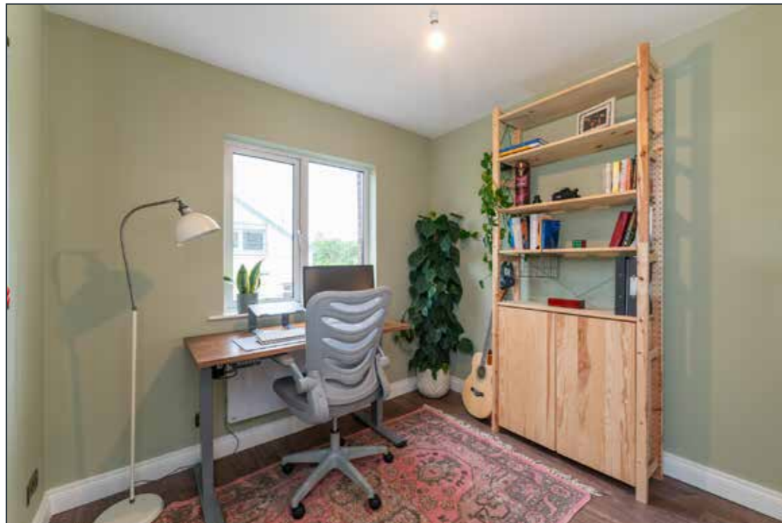
BEDROOM (2): 8' 9" x 8' 8" (2.67m x 2.64m) Built-in wardrobe, wood laminate floor.