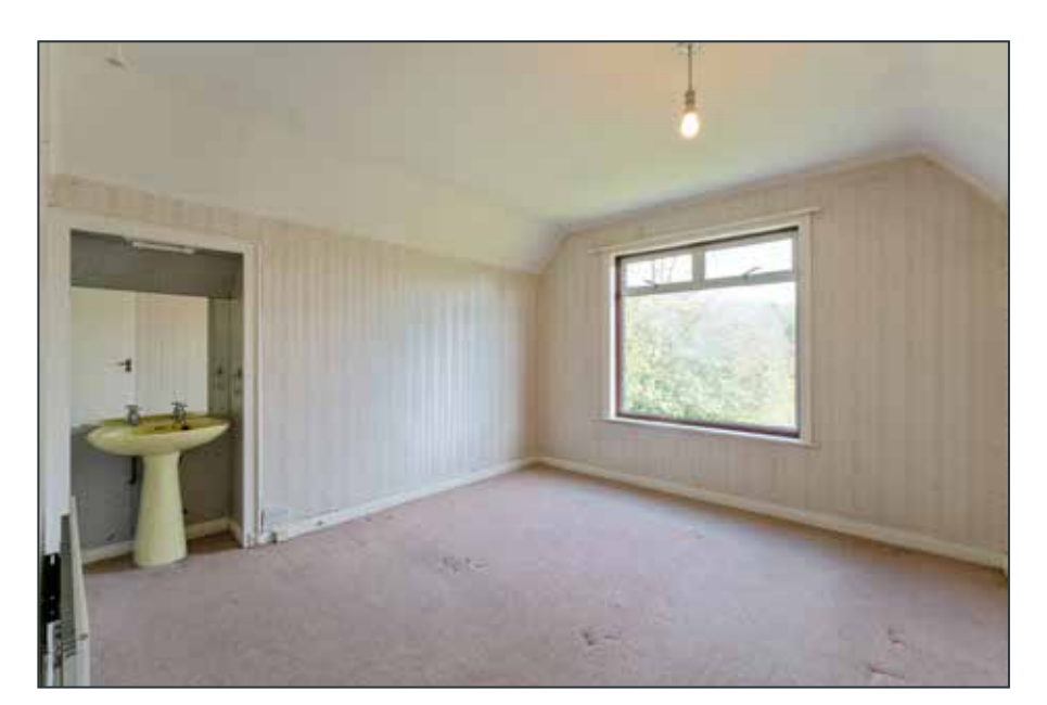
BEDROOM (2): 11' 5" x 11' 0" (3.48m x 3.35m)