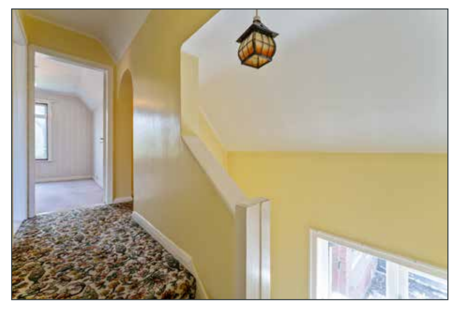
BEDROOM (1): 11' 6" x 11' 1" (3.51m x 3.38m)

Built in storage and drawers, seating area with storage drawers.