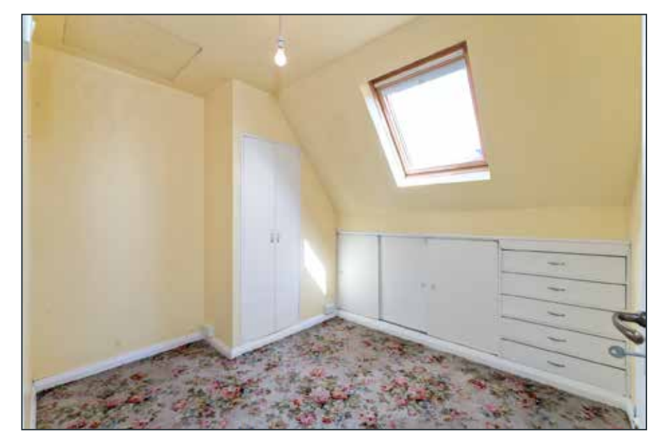
BEDROOM (3): 9' 8" x 8' 0" (2.95m x 2.44m) To Max.