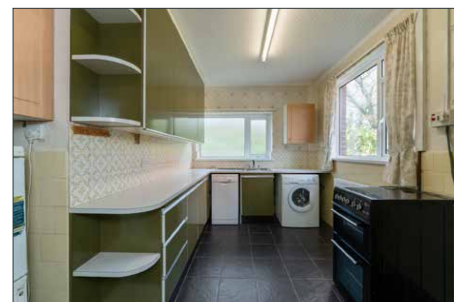
KITCHEN: 11' 5" x 8' 0" (3.48m x 2.44m) Full range of high and low level units, plumbed for dishwasher, plumbed for washing machine, partly tiled walls, ceramic tiled floor.