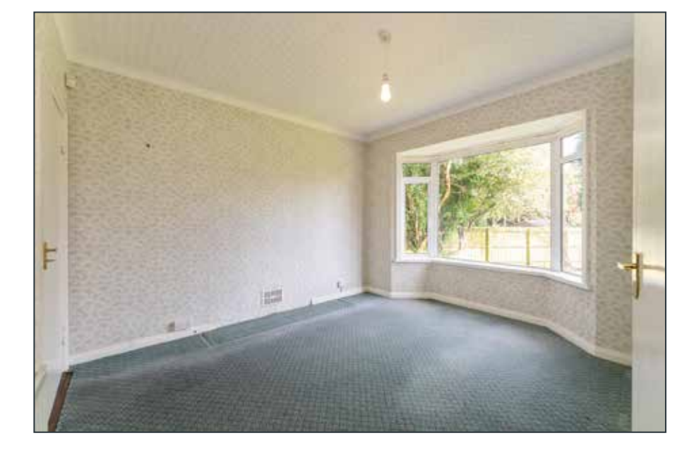
DINING ROOM: 13' 0" x 10' 10" (3.96m x 3.3m)