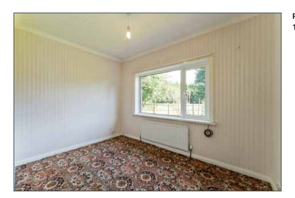
PLAY ROOM: 11' 4" x 7' 10" (3.45m x 2.39m)